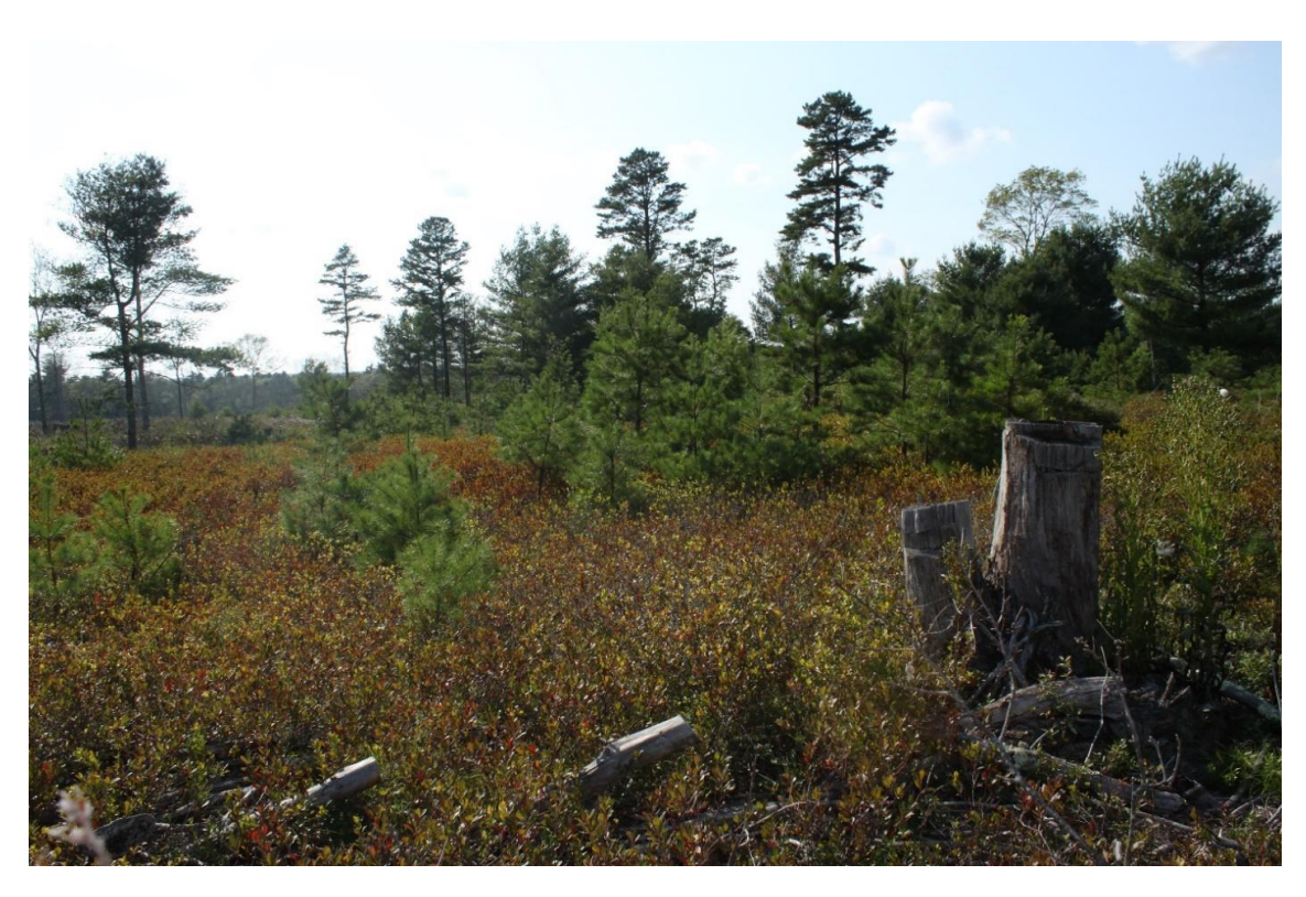
Slash was left throughout the cut, and now is mostly covered in the pine and berry producing understory.