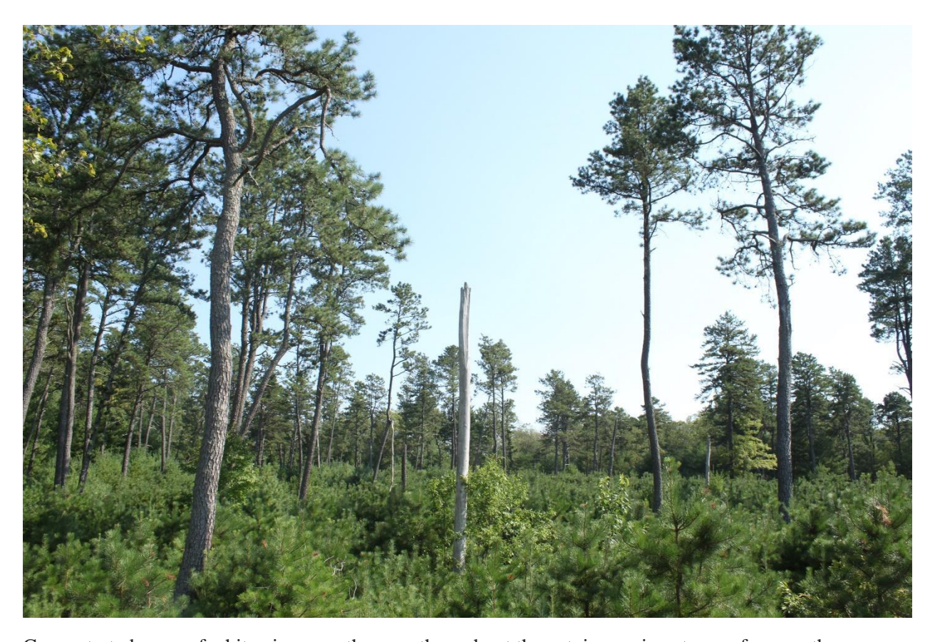
Concentrated areas of white pine growth occur throughout the cut, in varying stages of regrowth.

During a 2017 visit, we observed white tailed deer, eastern towhee, kestrel, sharp shinned hawk, purple martin, tree swallow, great blue heron and American woodcock.