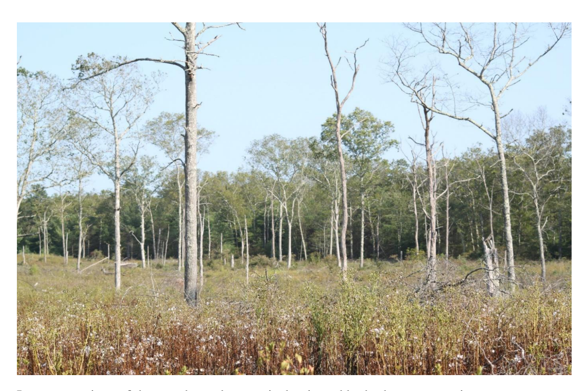
In some portions of the cut, the understory is dominated by herbaceous species.