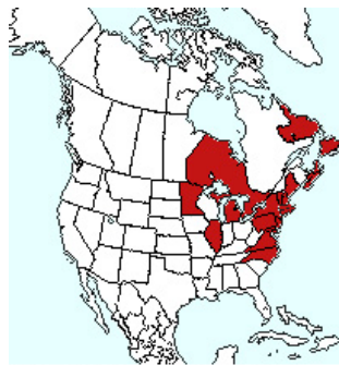
Native to northern and central Europe, planted as a timber tree and an ornamental in zones 2-6, known to escape.

Additional Range Information: Larix decidua is planted in the USDA hardiness zones shown above and may seed into the landscape . See states reporting European larch.